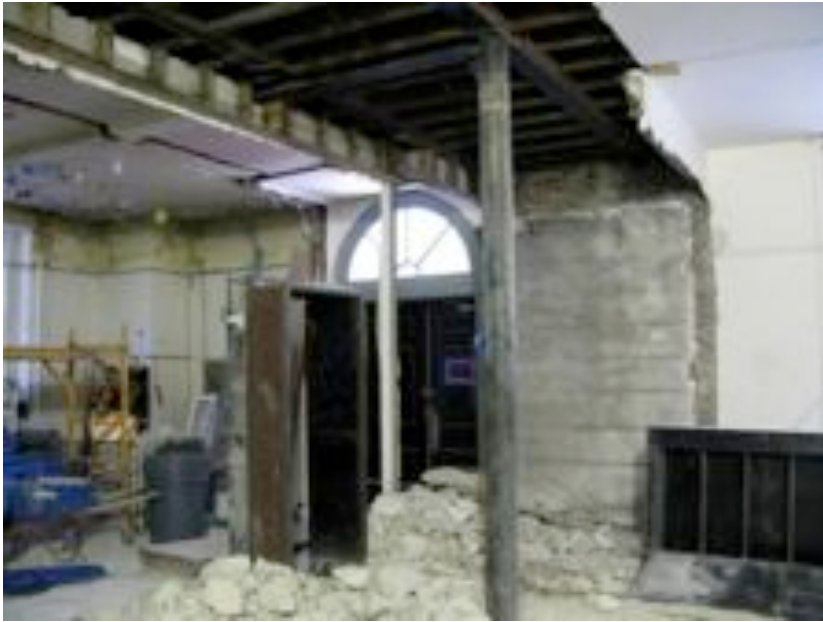
The first floor kitchen and muniment room demolition (left) and the courtyard outside Washburn House (below)